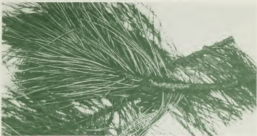
Red or Norway pine. (About one-third natural size)